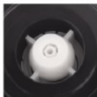
Removable check valve eliminates need for an in-line flow check