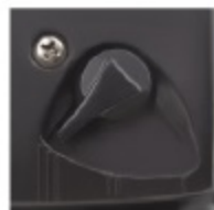
3-speed switch for extreme flexibility

Optional: bronze, brass or cast iron pump body.